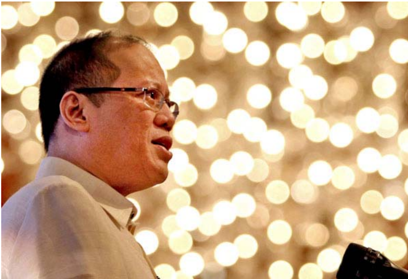
President Aquino addresses the 5th conference of the Global Organization of Parliamentarians Against Corruption at the PICC yesterday.

MANILA, Philippines - Without continuity and long-term structural reforms, President Aquino warned yesterday the Philippines would still be vulnerable to corruption especially if there would be "another corrupt president."